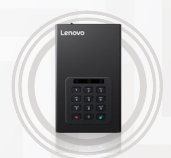
Lenovo Secure Desktop Hard Drive