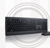
Lenovo Professional Wireless Keyboard & Mouse Combo